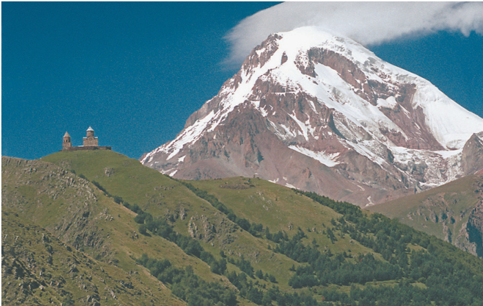
Gergeti Trinity Church sits near Mount Kazbegi.

tion about the club can be found at www.gaumarjos.jp . There are also many interesting facts about Georgia on our tourism website ( https://letsgeorgia.com ). Georgia and Japan have many important similarities. We both are among the oldest countries, with exceptional cultures of hospitality. Both our nations succeeded in preserving their traditions in parallel with their transitions into modern societies. Most importantly, we have exemplary positive political and economic relationships. Last year, Japan and Georgia signed a bilateral investment treaty and an agreement for the avoidance of double taxation. We have since witnessed increased interest from Japanese companies in doing business in Georgia. In the end, I would like to again express words of gratitude to our friends in Japan for their important contribution to the development of Georgia, for engaging in extremely positive political, economic and cultural relationships, and for the support of our sovereignty and territorial integrity. I'm absolutely sure that the already excellent relationship between our countries will become even closer and more cordial in the years to come. Gaumarjos (cheers).