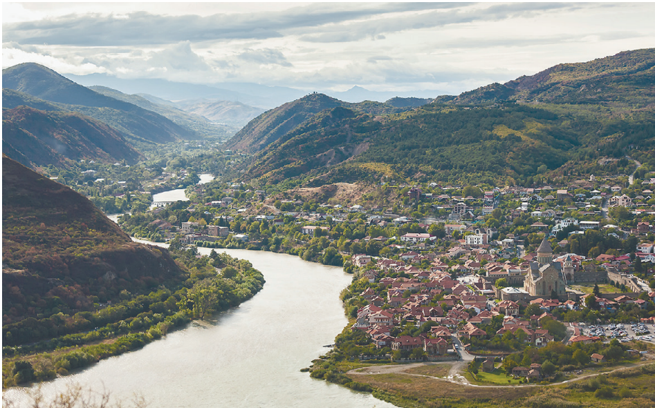
Mtskheta, the former capital of Georgia EMBASSY OF GEORGIA