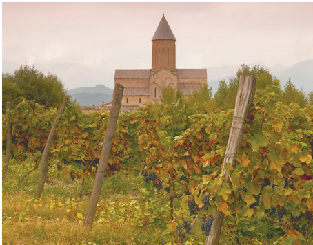
The Alaverdi Monastery is known for its architecture and winemaking.