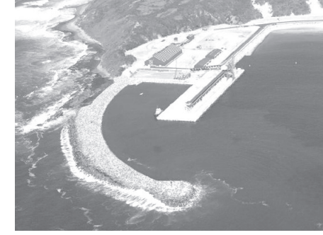
The Port of Ehoala constructed by Daiho Corporation

Congratulations to the People of the Republic of Madagascar on the Anniversary of Their Independence