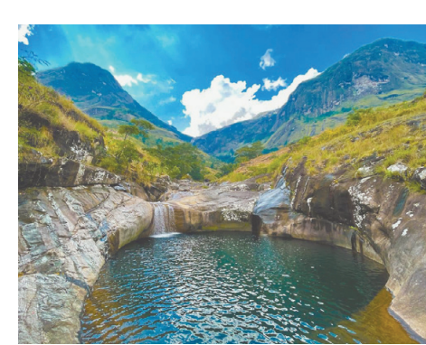
Left: Liwonde National Park is home to a wide variety of animals. Right: Mbiya pool is a natural rock formation on Mount Mulanje, the tallest peak in Malawi.