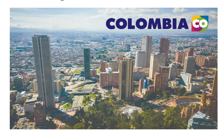
Bogota boasts historic architecture and is home to many museums.

We support the Colombian coffee industry through our coffee concern