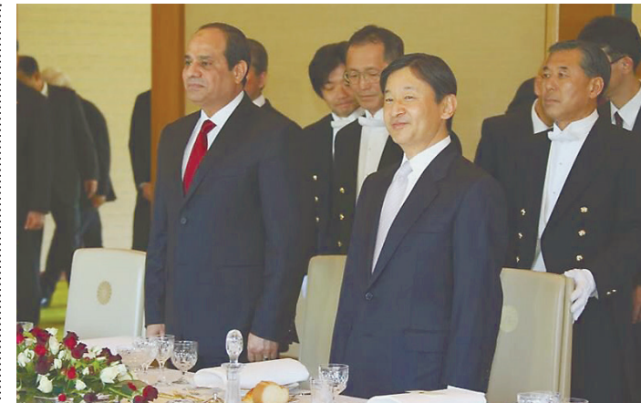
Egyptian President Abdel Fattah el-Sissi (left) stands next to Emperor Naruhito at the imperial palace in March 2016.

Adding to the above, since 1974, Japan has been a constant partner in promoting