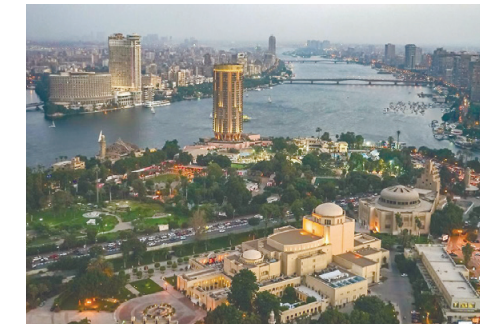
The Nile River flows through Cairo. EMBASSY OF EGYPT

This content was compiled in collaboration with the embassy. The views expressed here do not necessarily reflect those of the newspaper.