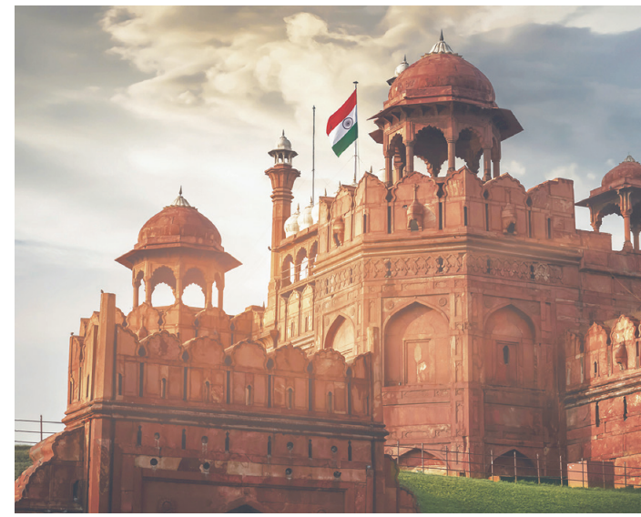
Lahore Gate, Red Fort, Old Delhi INCREDIBLE INDIA

Modi's unwavering faith in his mission, I believe, comes from his deep understanding of the ancient Indian philosophy of Santhana Dharma, and his strong faith in Indian Saints, such as Sri Aurobindo, whose 150th birth anniversary is today.