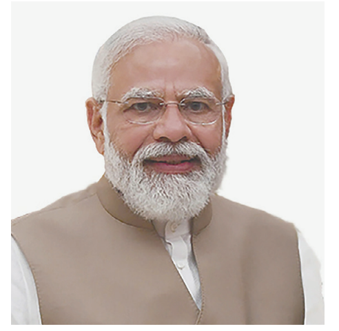
Prime Minister Narendra Modi EMBASSY OF INDIA

health care, manufacturing, micro, small and midsize enterprises, and startups. Collaboration in critical minerals and frontier technologies for 5G and beyond, big data, quantum computing, blockchain, Internet of Things, data security, networks, data transport systems and more are essential to creating resilient supply chains. India is also emerging as a top source of skilled human