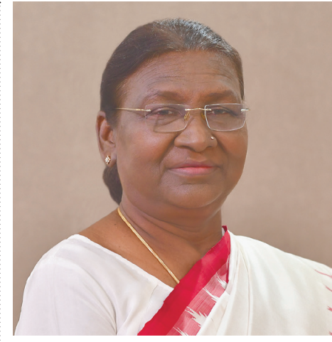
President Droupadi Murmu EMBASSY OF INDIA

"Co-innovate," "co-create" and "co-produce" are new potential mantras for future collaboration. Unmet potential exists in areas such as food security, education, the environment, renewable and clean energy (hydrogen and ammonia as fuel),