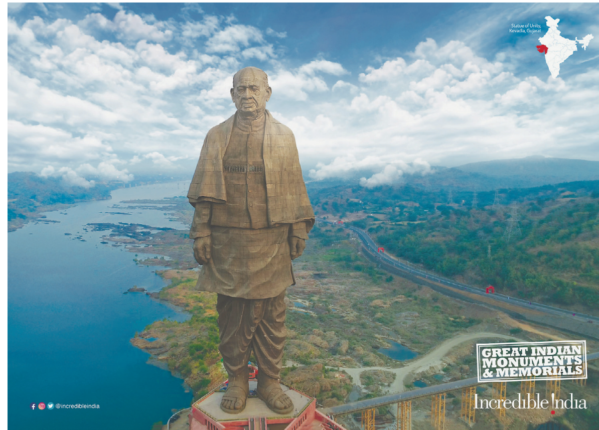
The Statue of Unity is the world's biggest statue, depicting Indian statesman and independence activist Vallabhbhai Patel. INCREDIBLE INDIA

Thank you! Our Prime Ministers Narendra Modi and Abe were soul mates. So must be our peoples. Above us must be no cloud.