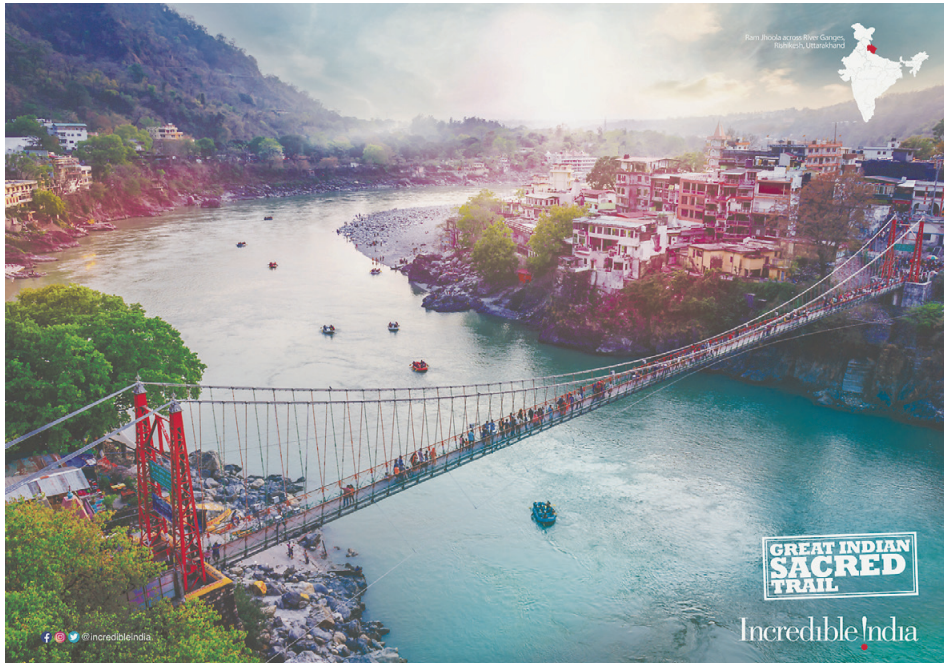
Ram Jhoola bridge spans the Ganges River in Rishikesh, Uttarakhand state. INCREDIBLE INDIA

India is not self-sufficient in energy, spending over 12 lakh crore rupees ($140 million) on importing energy supplies.