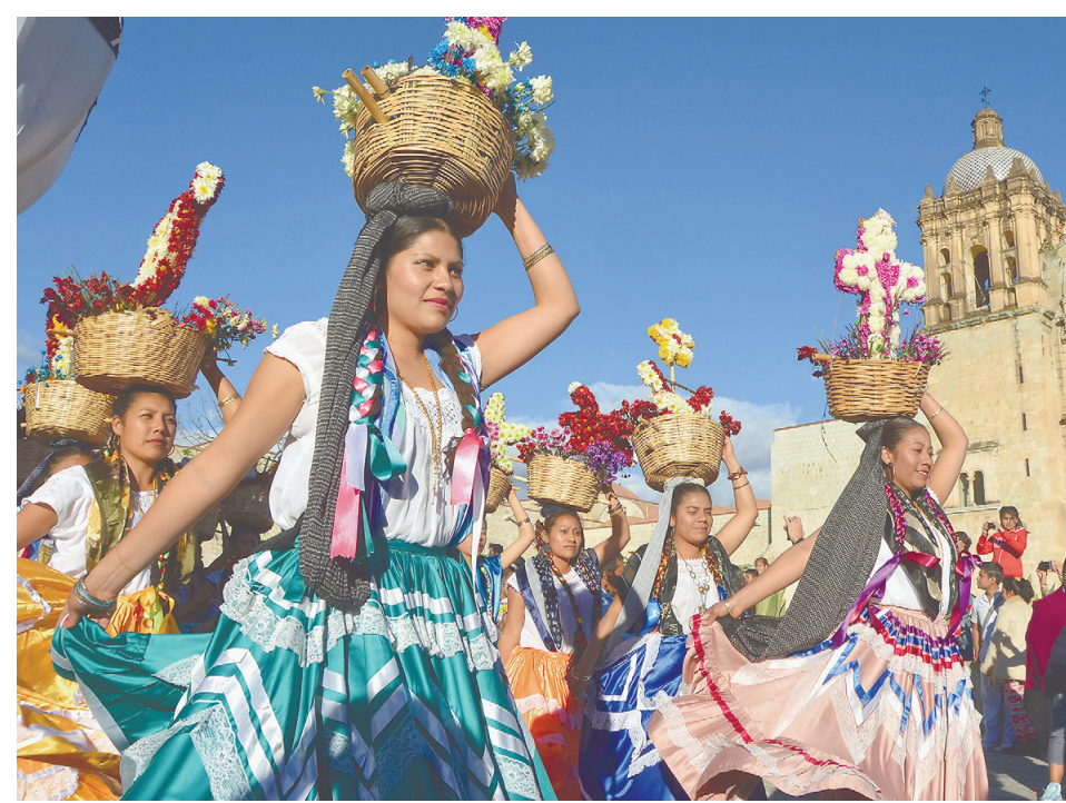
The annual Guelaguetza Festival in Oaxaca celebrates the region's indigenous culture, diversity and ancient traditions.