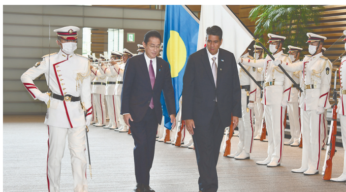
Kishida and Whippis inspect the honor guard during the president's visit to Japan in September. EMBASSY OF THE REPUBLIC OF PALAU

This content was compiled in collaboration with the embassy. The views expressed here do not necessarily reflect those of the newspaper.