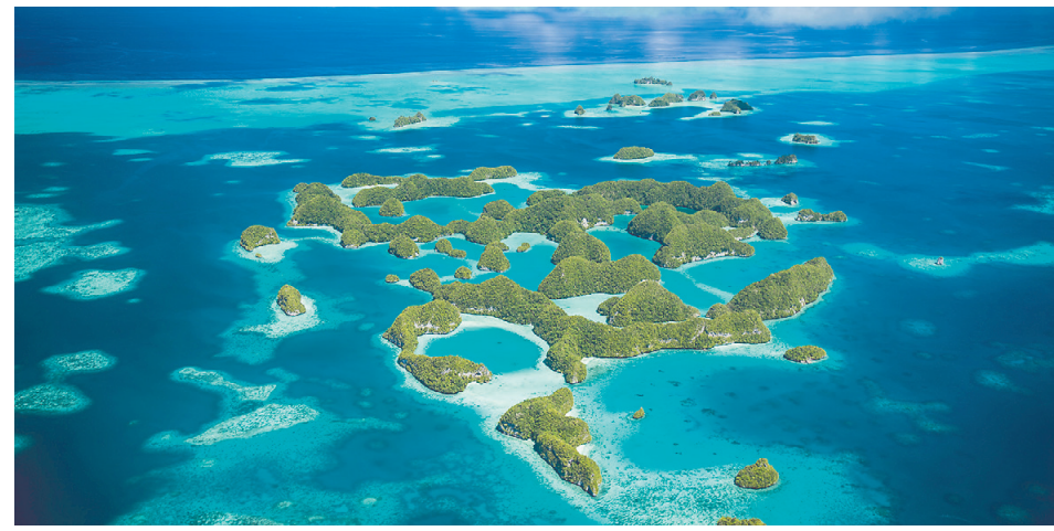
The Rock Islands Southern Lagoon is registered as a mixed UNESCO World Heritage Site. The limestone islands between Koror and Peleliu are among Palau's world-famous diving spots.

Once again, I would like to pay tribute to the 28 years of Palau's independence and sincerely wish for Palau's continued prosperity.