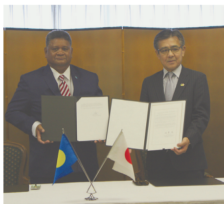
Minister of State Gustav Aitaro and Japanese Ambassador Akira Katsura pose on Sept. 8 after exchanging notes on grant aid for developing Palau's power transmission network.

Congratulations to the People of the Republic of Palau on the Anniversary of Their Independence