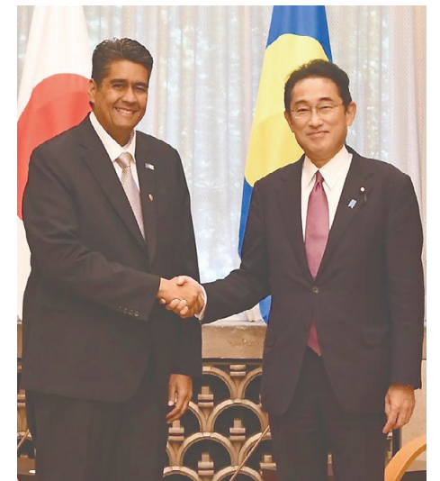
Palau President Surangel S. Whippis Jr. poses with Prime Minister Fumio Kishida on Sept. 9 before issuing a joint statement later in the day.

May God continue to bless the peoples of Palau and Japan.