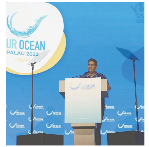
Palau and the United States co-host the seventh Our Ocean Conference in April.

OFFICE OF THE PRESIDENT, REPUBLIC OF PALAU