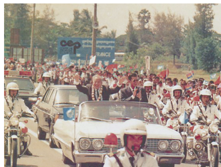
Left: Then-King His Majesty Norodom Sihanouk (left) and Prime Minister Hun Sen receive a warm welcome in Phnom Penh in November 1991. Right: People ride an elephant past Bayon temple, part of the vast Angkor Wat temple complex.

In conclusion, I sincerely wish for the good fortune and prosperity of Cambodia and its people, and I pray for further friendship between Cambodia and Japan.