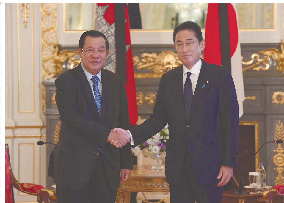
Prime Minister Hun Sen and Prime Minister Fumio Kishida shake hands at a bilateral meeting on Sept. 28 in Tokyo.

On regional and international cooperation, Cambodia has been proud to hold the 2022 Association of Southeast Asian Nations chairmanship under the theme of "ASEAN A.C.T.: Addressing Challenges Together," and was congratulated on hosting the 55th ASEAN Ministerial Meeting and related