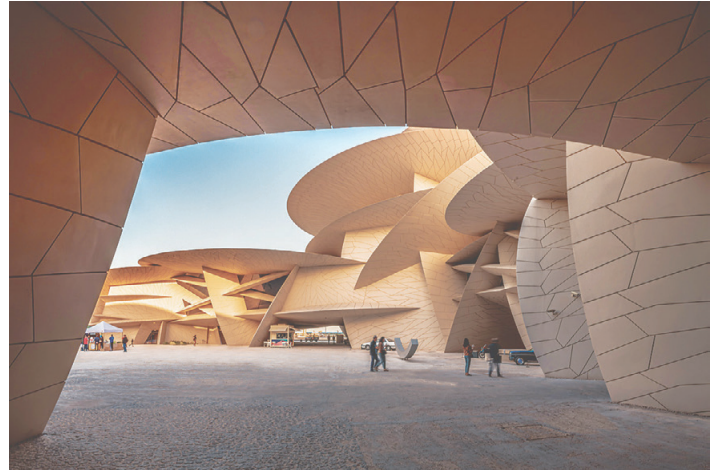
The National Museum of Qatar takes design inspiration from desert