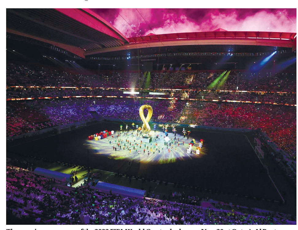
The opening ceremony of the 2022 FIFA World Cup took place on Nov. 20 at Qatar's Al Bayt Stadium. EMBASSY OF THE STATE OF QATAR