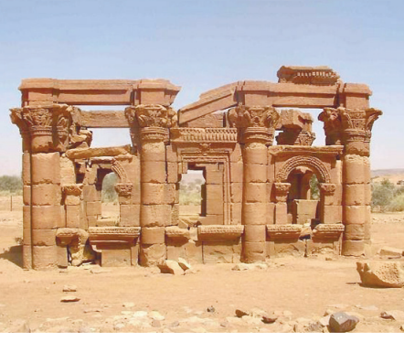
A Roman kiosk stands in the ancient city of Naga.