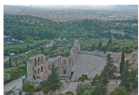
The Herodes Atticus Odeon, an amphitheater built in the second century at the foot of the Acropolis in Athens, is used today for art performances.

Warm greetings on our National Day and long live the friendship between Greece and Japan.