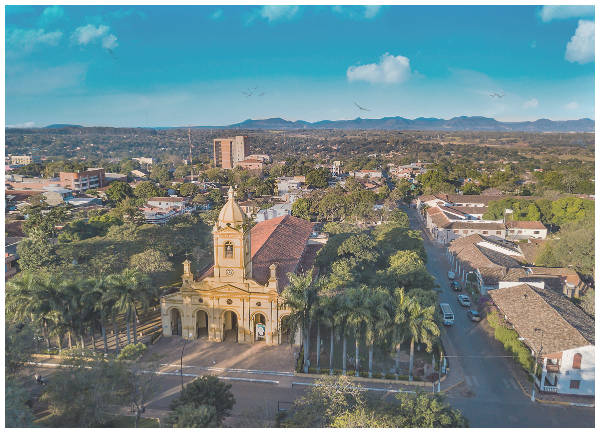
Left: The Cathedral of Villarrica has a history dating back several hundred years. Below: Tourists admire Iguazu Falls, one of the world's great natural wonders, near the border of Argentina and Brazil.

For Paraguay it will mean creating a closeness to East Asia like never before in its history, while for Japan it will mean