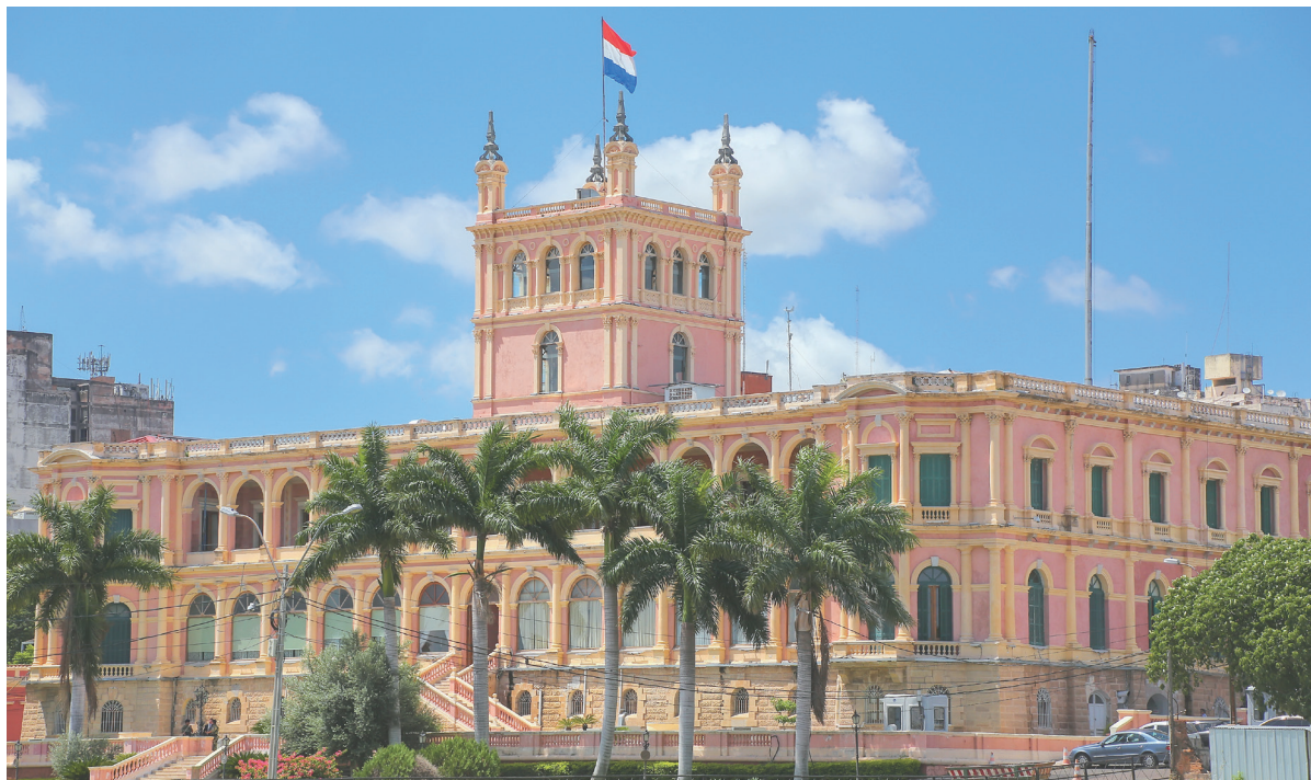
The Presidential Palace in Asuncion serves as the workplace for the president and the government.

Congratulations to the People of the Republic of Paraguay on the Occasion of the Anniversary of Their Independence