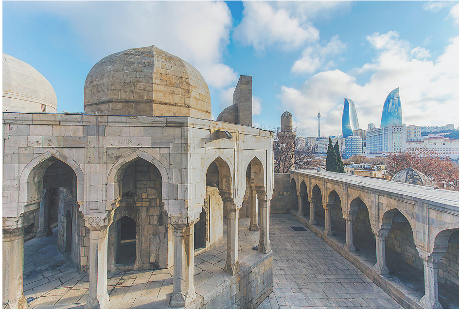
The Palace of the Shirvanshahs is a UNESCO World Heritage Site.

Azerbaijan is the restoration, reconstruction and development of liberated territories. The government is swiftly advancing these efforts, alongside the successful resettlement of former internally displaced persons back to their ancestral lands. Currently, approximately 5,400 of these people have already returned and the plan is to settle 20,000 in five cities and 15 villages by the end of the year. The first phase of the Great Return program will be completed by the end of 2026, when 140,000 displaced people will have returned to their ancestral lands.