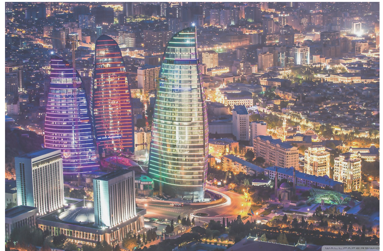
The Flame Towers illuminate central Baku.

Additionally, Azerbaijan's strategic position as a global transport hub enhances its significance. Our country maintains a fully operational transport infrastructure, including extensive railway networks, highways and maritime facilities, all con-