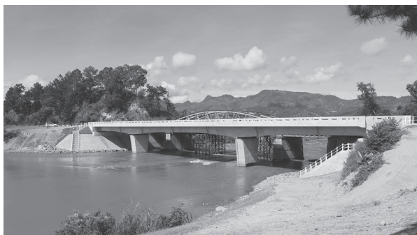
Mangoro Bridge, completed in January 2024