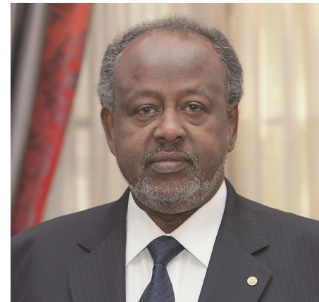
President Ismail Omar Guelleh