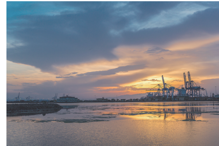
The port of Djibouti is located on one of the busiest shipping routes in the world.