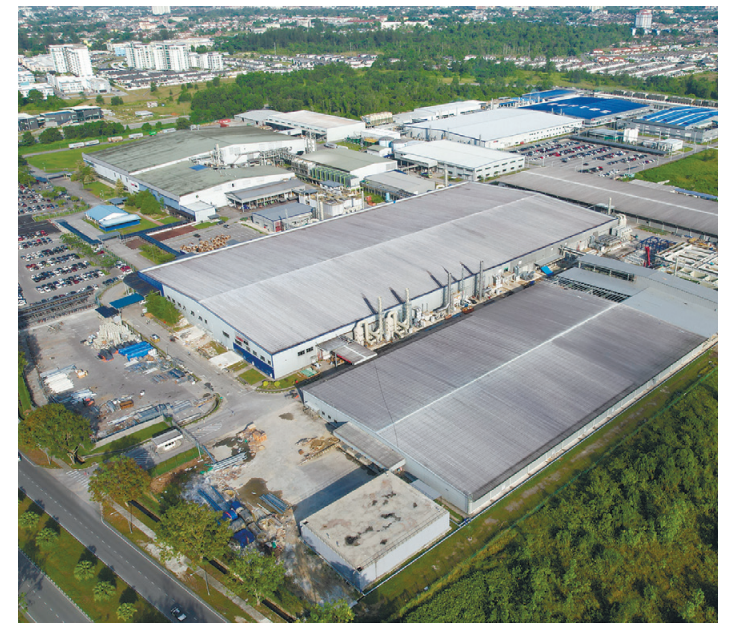
Far left: The Petronas Twin Towers in Kuala Lumpur are the tallest twin skyscrapers in the world. Left: The Sama Jaya Free Industrial Zone is home to major electronics, semiconductor and solar power manufacturers.