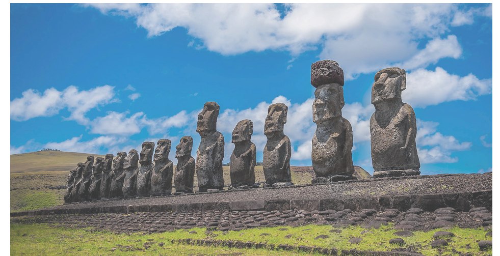
Easter Island is home to the enigmatic Moai statues.

Congratulations to the People of the Republic of Chile on the Anniversary of Their Independence