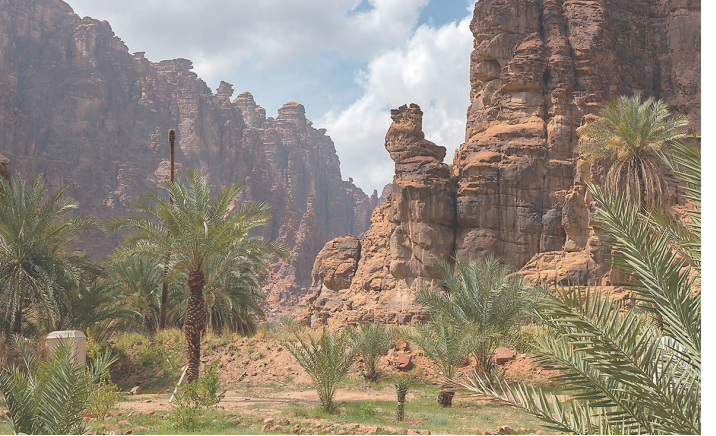
Left: Al-Balad old town in Jeddah features traditional houses with wooden windows and balconies. Right: The Wadi Al Disah is a mountainous area in Tabuk province.