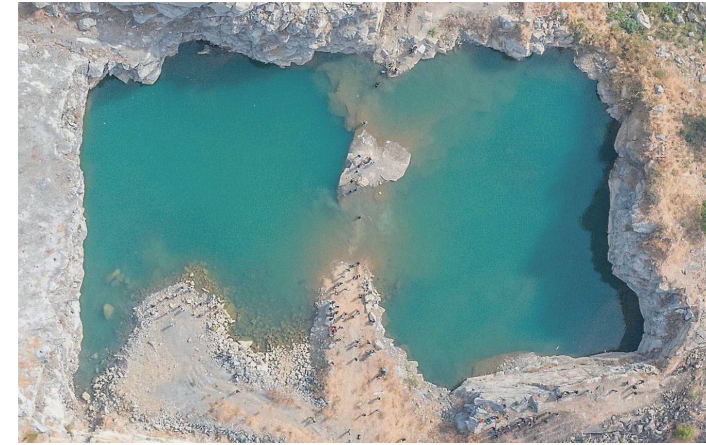
Ushafa Crushed Rock is a former quarry in Abuja. EMBASSY OF NIGERIA

This content was compiled in collaboration with the embassy. The views expressed here do not necessarily reflect those of the newspaper.