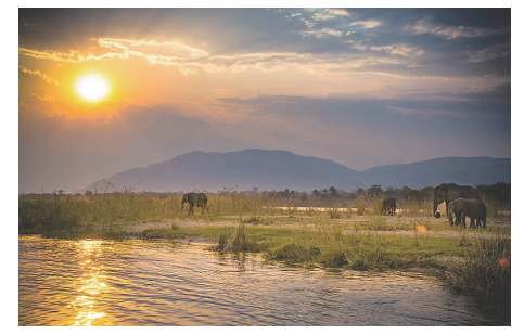
The sun sets over South Luangwa National Park. Right: Zebras are endemic to Zambia.