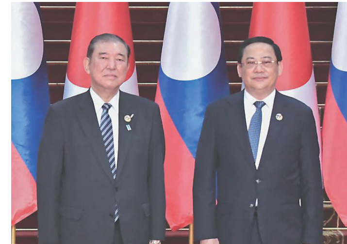
Far left: The Japanese government has decided to provide grant aid worth ¥2.8 billion to help develop Vientiane International Airport. Left: Prime Minister Shigeru Ishiba (right) attends a welcome ceremony with Laotian Prime Minister Sonexay Siphandone on Oct. 11.

Hydropower is one of our main exports. I think both sides could further work together, especially under Japan's AZEC initiative. Apart from this, the promotion of youth and other exchange programs, as well as direct flights between our countries, must be further enhanced and developed. Therefore, I'd like to take this opportunity to cordially invite all readers, businesses