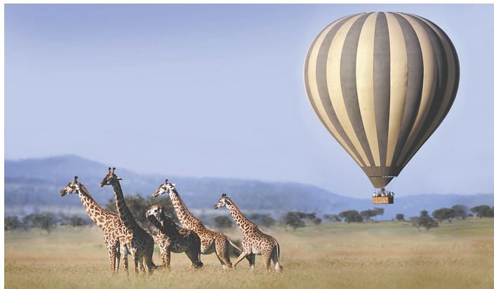
Visitors on a hot air balloon safari in Maasai Mara National Reserve watch giraffes at sunrise.

Congratulations to the People of the Republic of Kenya on the Anniversary of Their Independence