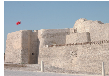
Above: Bahrain Fort is an archaeological site dating back to 2300 B.C. Right: The Bahrain World Trade Center, standing 240 meters over Manama, is the first skyscraper in the world to include wind turbines in its design.

This content was compiled in collaboration with the embassy. The views expressed here do not necessarily reflect those of the newspaper.