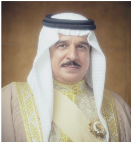
H.M. King Hamad bin Isa Al Khalifa

Economic collaboration has been at the heart of this relationship, particularly through strategic agreements and investments that have helped shape a prosperous landscape for both nations. The Agreement between Japan and the Kingdom of Bah-