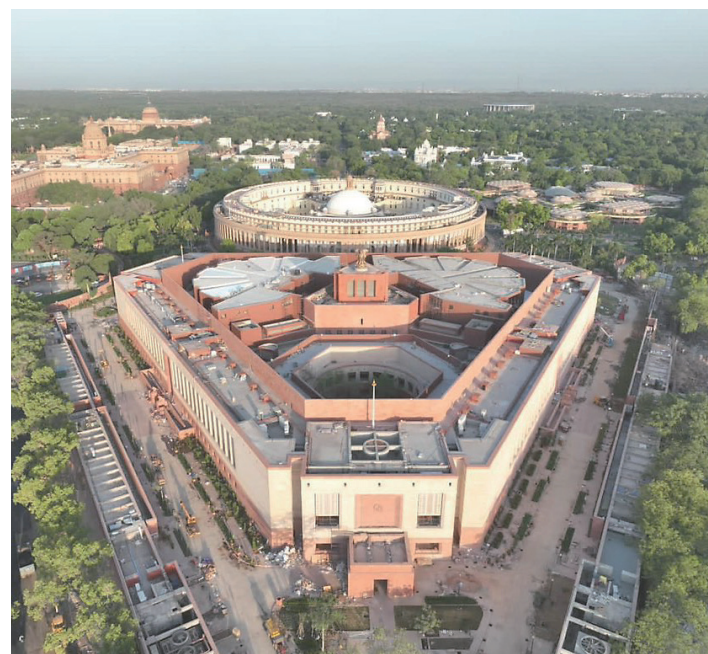
India's Parliament House in New Delhi was inaugurated in 2023.

The Indian Commerce and Industry Association Japan, with a history spanning over 104 years, serves as an apex body providing support, guidance and advisory services to all interested parties, enabling them to fully develop the economic potential and investment opportunities between Japan and India. On behalf of all ICIJ members, I convey our deepest appreciation to the readers of The Japan Times.