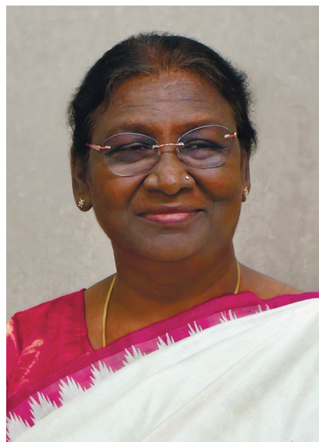
President Droupadi Murmu

Over the past year, there has been excellent momentum in the high-level engagements between India and Japan. The Hon. Prime Minister Narendra Modi met with the Hon. Prime Minister Shigeru Ishiba on the sidelines of the East Asia summit in Laos. Prior to that, there were summit-level meetings on the sidelines of the summit of the group of seven leading industrial nations in Italy and the Quad meeting in the United States.