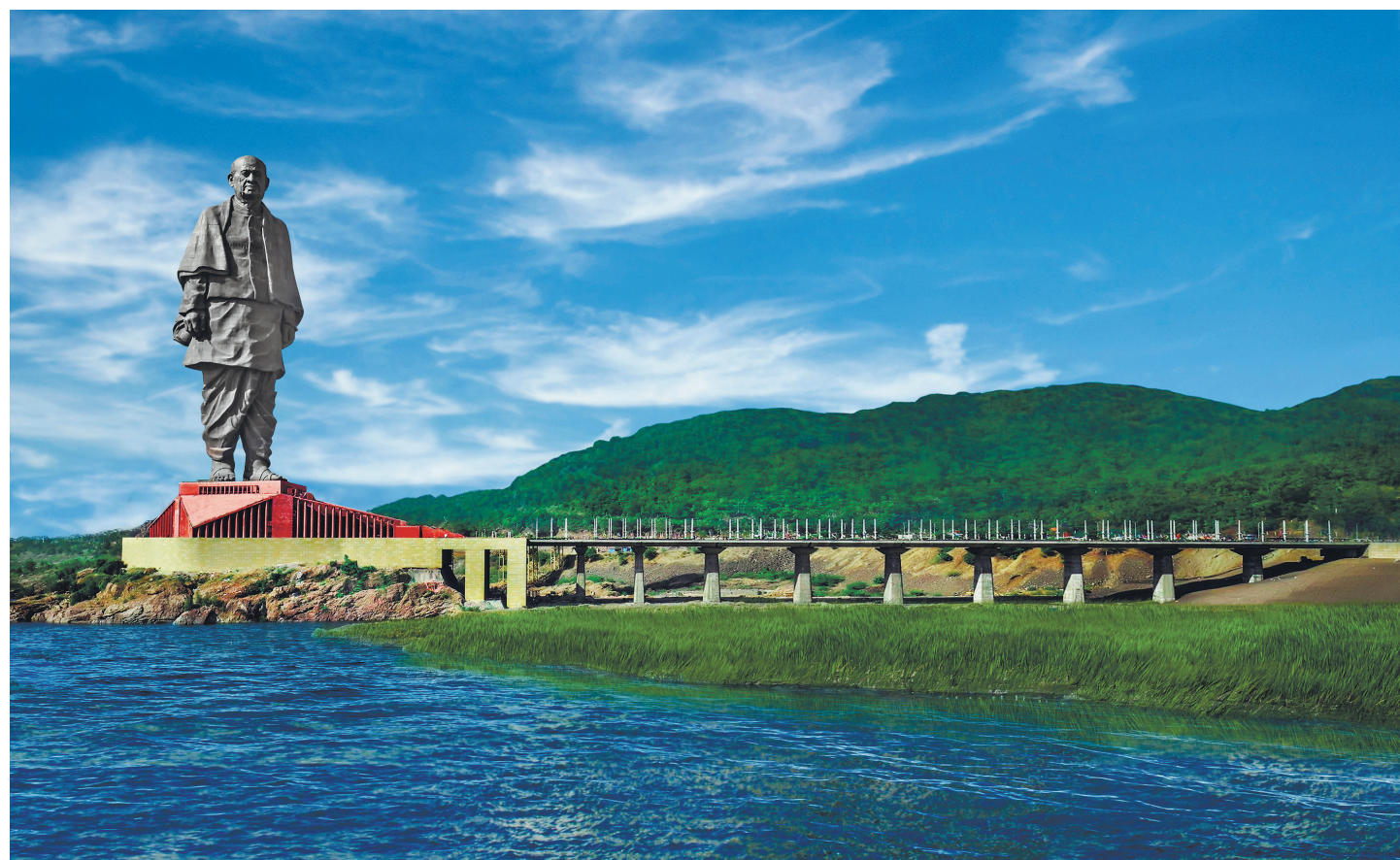
Honoring Indian politician and independence activist Sardar Patel, the Statue of Unity in Gujarat is the world's tallest, standing 182 meters. INCREDIBLE INDIA

One of the highlights of our progressive partnership this past year was the inaugural India-Japan economic security dialogue, including strategic trade and technology, held in Tokyo. There is recognition of a need to closely collaborate to protect economic interests and build resilient supply chains in an unpredictable geopolitical environment. This dialogue also provided an excellent opportunity to promote col-