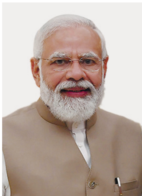
Prime Minister Narendra Modi

Our defense and security cooperation is a shining example of the significant progress in our bilateral partnership, with increased joint exercises and exchanges. Our defense chiefs met on the sidelines of the Association of Southeast Asian Nations defense ministers' meeting in Laos. The discussions at the "two-plus-two" foreign and defense ministerial dialogue in New Delhi,