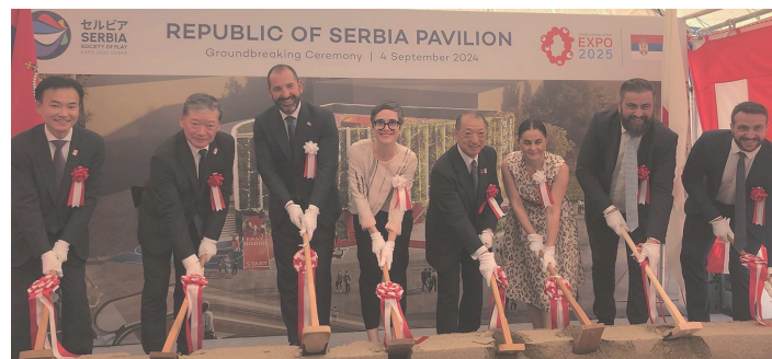
Ambassador Aleksandra Kovac takes part in the groundbreaking ceremony for the Serbian Pavilion for the 2025 World Expo in Osaka on Sept. 4.

This content was compiled in collaboration with the embassy. The views expressed here do not necessarily reflect those of the newspaper.