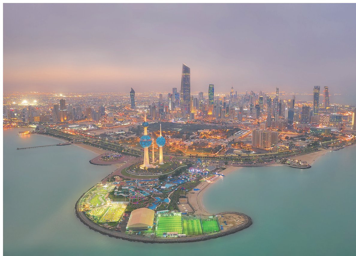
Left: Kuwait Tower shines like a jewel against the backdrop of the Kuwait City skyline. Below: The capital boasts an array of modern, world-class skyscrapers.