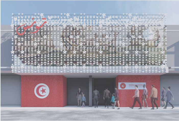
An artist's image of the front of the Tunisia Pavilion at the Osaka Expo

For half a century, we have collaborated on advancing Tunisia's socioeconomic development in key sectors such as transportation, energy and water. The Rades-La Goulette Bridge, spanning the Lake of Tunis, stands as a symbol of our cooperation. Two power plants we supported now contribute 10% of Tunisia's total energy production. Our joint efforts in enhancing water management systems and industrial development have significantly improved the quality of life for Tunisians and strengthened the friendship between Tunisia and Japan. The upcoming ninth Tokyo International Conference on African Development in August presents an excellent opportunity to further our partnership in the region. I am eager to see Tunisia's leadership, which graciously hosted TICAD 8 in 2022, open new avenues for cooperation among Tunisia, JICA and neighboring countries. JICA's vision of "Leading the World with Trust" is more relevant than ever as the world faces compounded crises. On this National Day, we celebrate Tunisia's achievement and our steadfast trust and friendship, looking forward to a brighter future together.