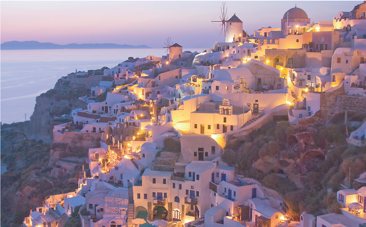
Left: The village of Oia on Santorini Island is known for its beautiful white-washed buildings. Below: The Ancient Theatre of Epidaureus is included on UNESCO's World Heritage List.

Greece actively participates in and even