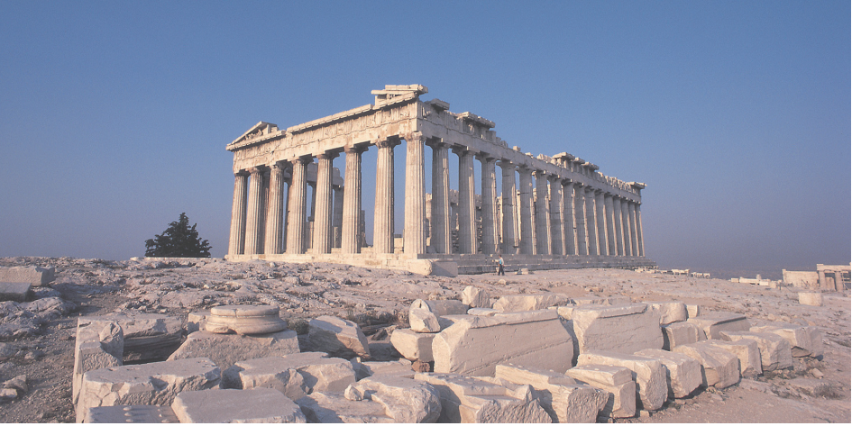
The Parthenon attracts millions of tourists every year.

Long live Greece! Long live the friendship between Greece and Japan!