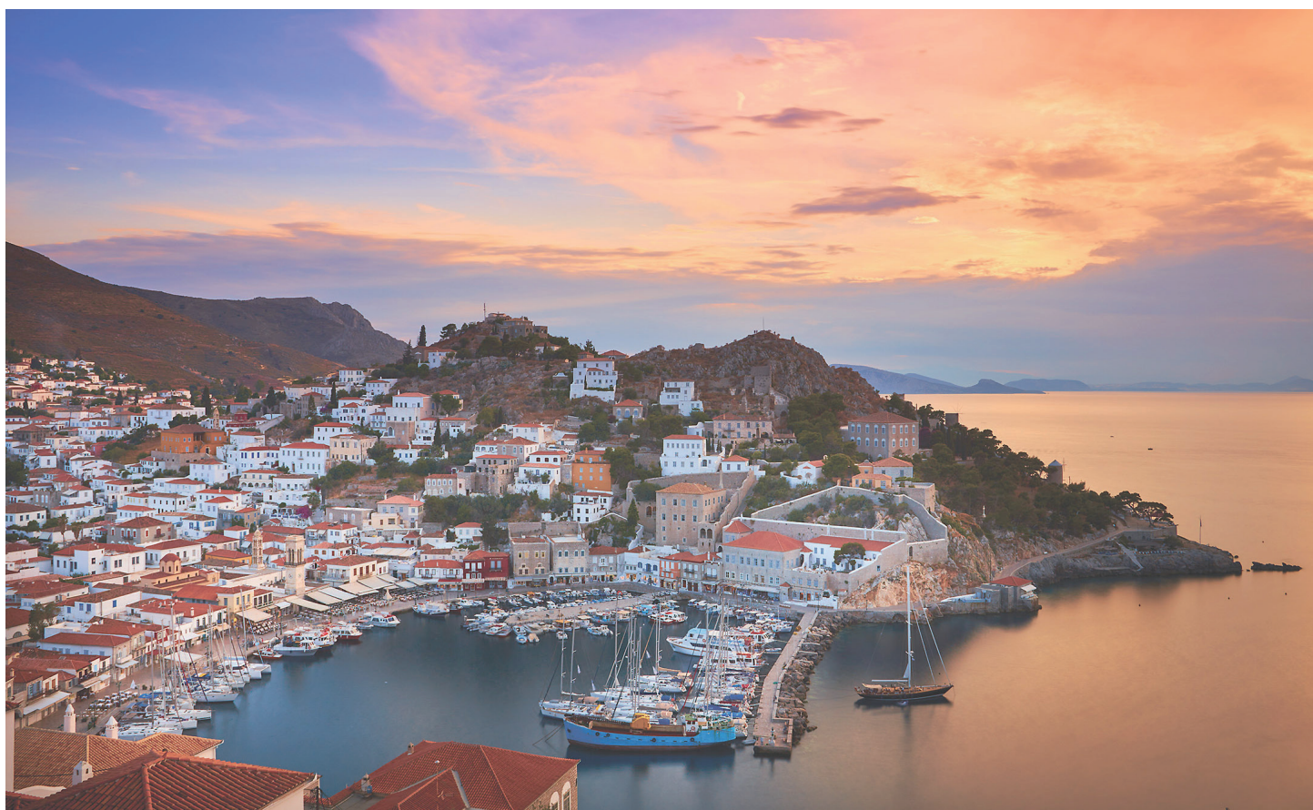
Hydra Island is a popular tourist destination.