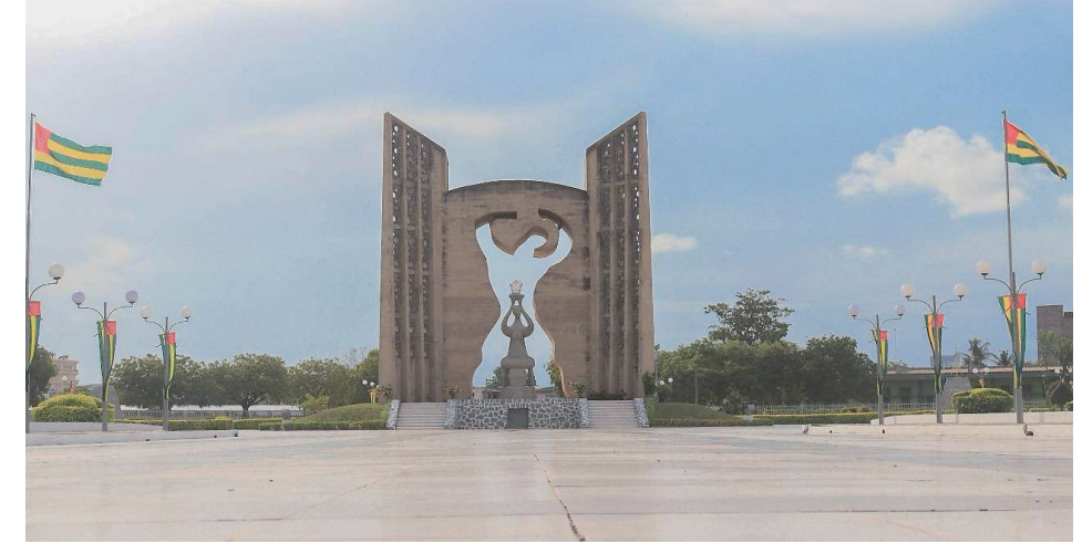
The Independence Memorial of Togo EMBASSY OF TOGO

This content was compiled in collaboration with the embassy. The views expressed here do not necessarily reflect those of the newspaper.