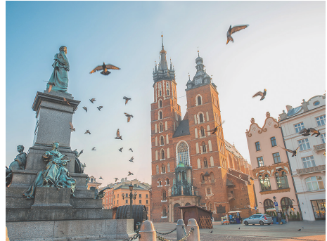
laboration with the embassy. The views expressed here do not necessarily reflect those of the

In such challenging times, Poland is glad to acknowledge that its friendship with Japan is as strong as ever, and the prospects