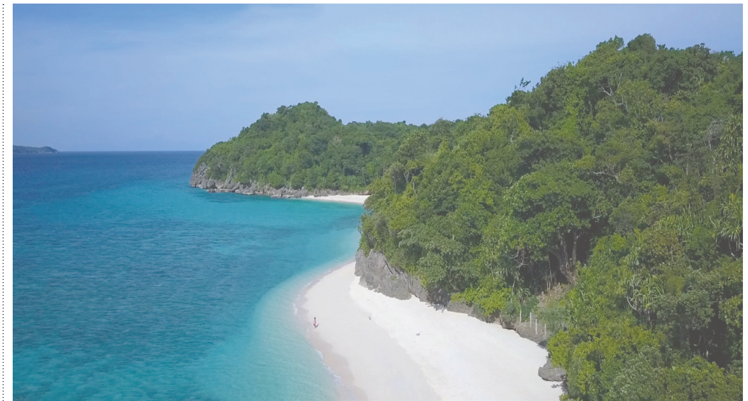
Above: The famed resort island of Boracay is known for its white sand beaches and cultural festivals.

In April, I had the honor of welcoming Prime Minister Shigeru Ishiba to the Philippines, in a visit that we regard as emblematic of the "golden age" of our bilateral ties. Prior to this, I also received Foreign Minister Takeshi Iwaya and Defense Minister Gen Nakatani, further underscoring our shared commitment to strengthening defense cooperation and promoting regional security toward our common