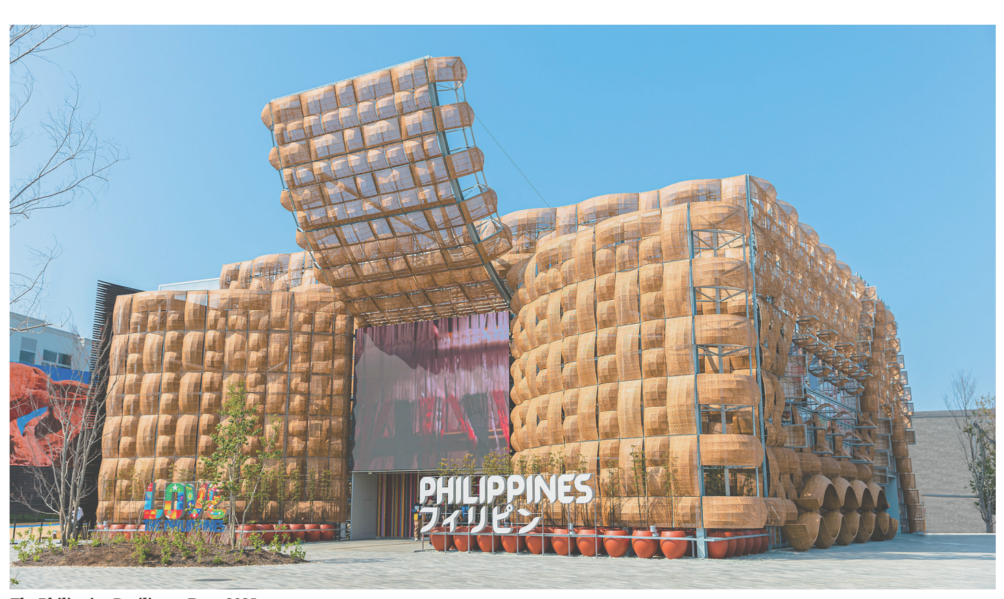
\textbf{The Philippine Pavilion at Expo 2025.} \quad \texttt{PHILIPPINES TOURISM PROMOTIONS BOARD}