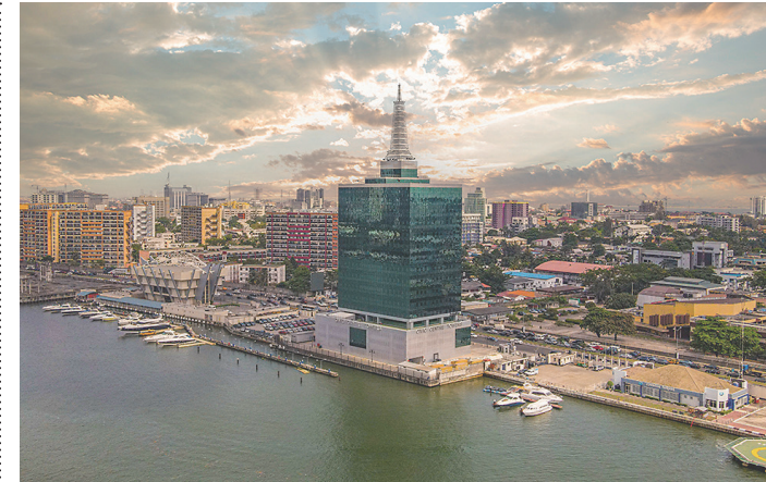
Civic Tower is a modern icon in Lagos.

With respect to our relations with Japan, it is worth noting that the recently concluded ninth Tokyo International Conference on African Development witnessed representation at the highest political level, with our president in attendance. This further reflects the growing strength of our relations and opportunities for deeper collaboration. To our vibrant diaspora, your contributions remain indispensable. Through remittances,