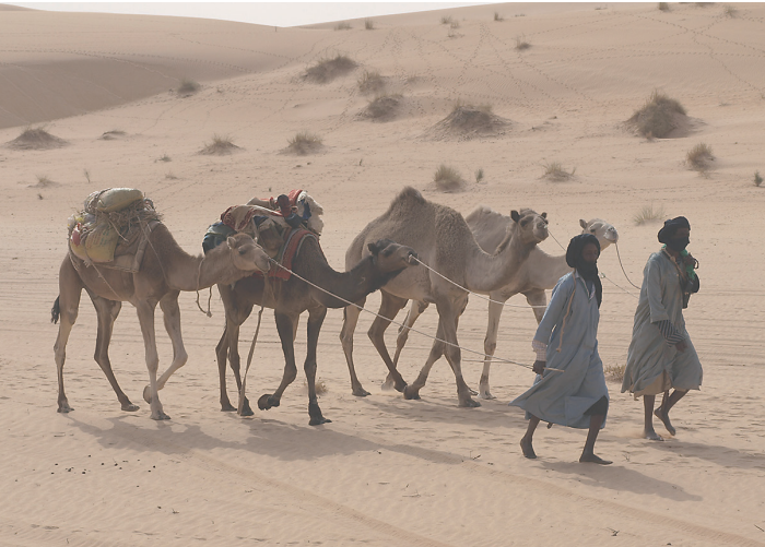
Camels are led across the sand near the Tanouchert Oasis.

Energy is another rapidly growing sector in Mauritania with considerable export potential. In addition to becoming a gas-exporting country by 2025, Mauritania boasts one of the best potentials for green hydrogen. With its long coastline on the Atlantic Ocean (over 700 km), Mauritania has all the right elements — sun, wind and sea — to produce green hydrogen that can be easily exported to nearby, high-demand