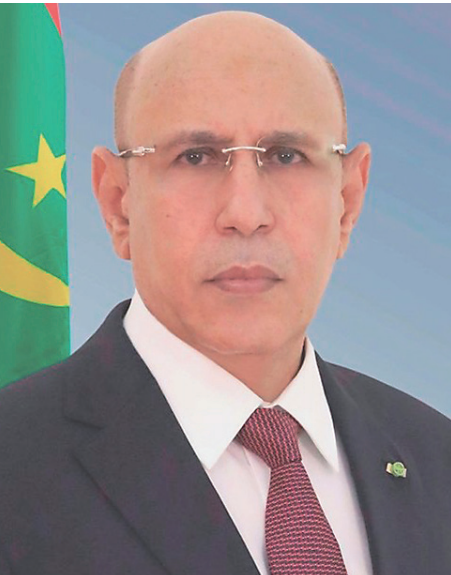
President Mohamed Ould Cheikh El Ghazouani

Beyond that, there is boundless potential