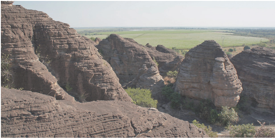
The Domes of Fabledougou are sandstone and limestone formations that are almost 2 billion years old.

Happy Independence Day! Arigatō gozaimasu (thank you)!