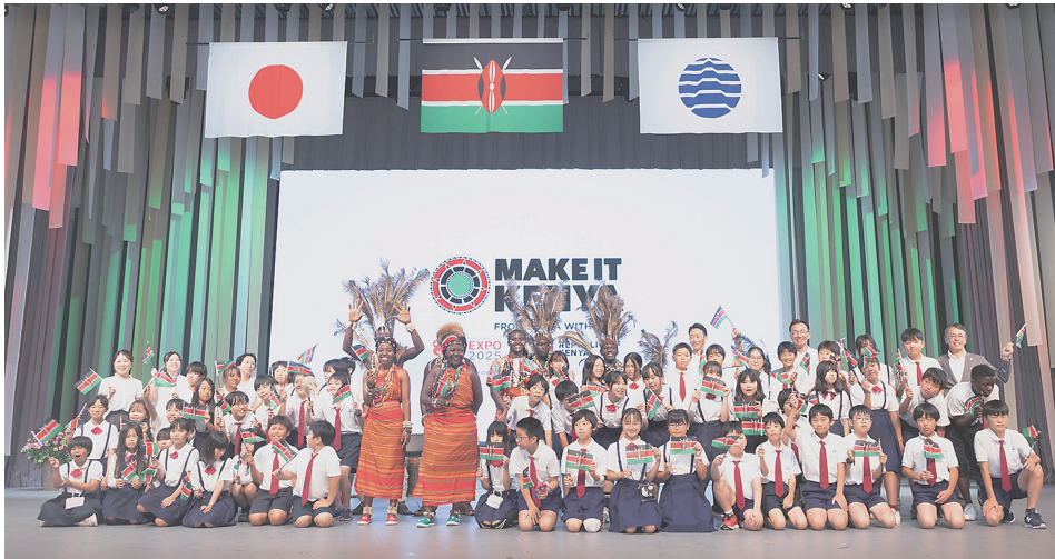
A group of schoolchildren join in the Kenya National Day of Honour celebrations at the Osaka Expo on June 24.

Congratulations to the People of the Republic of Kenya on the Anniversary of Their Independence