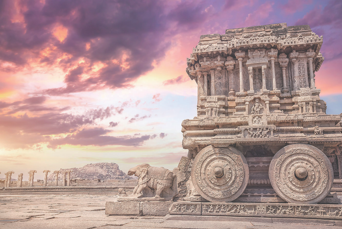
Left: Steep mountains and remote towns characterize the Spiti Valley in Himachal Pradesh; Right: The iconic Stone Chariot stands in the village of Hampi in Karnataka. INCREDIBLE INDIA