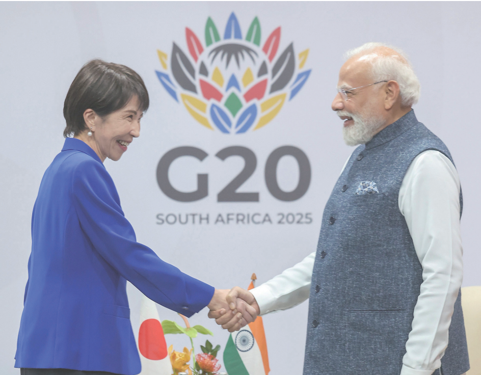
Prime Minister Sanae Takaichi and Prime Minister Narendra Modi meet on the sidelines of the 20th G20 leaders' summit in Johannesburg, South Africa, in November.

honor for me to carry forward this noble tradition. Our bilateral relations have been evolving significantly over the last decade under the special strategic and global partnership and the shared vision of a free and open Indo-Pacific. These ties have been further augmented by consistent high-level engagements and an unwavering commitment to our mutual security and prosperity. In 2026, as both Japan and India continue to bear significant global responsibilities, I look forward to even more robust and meaningful interactions between our countries to grapple with various complex issues the world is facing today. I firmly believe that our time-tested partnership will flourish even further as we approach the historic 75th anniversary of the establishment of diplomatic ties next year. On this auspicious occasion, I pray for the continued prosperity of India and the well-being of its people.