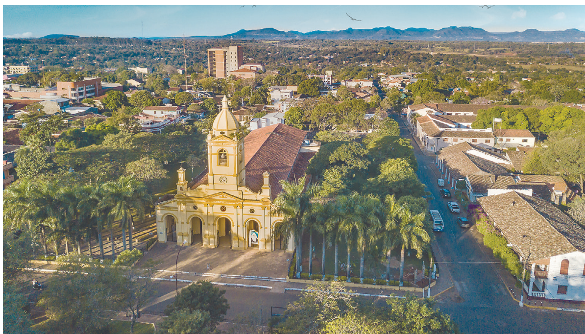
The Saint Claire Cathedral is a historic Roman Catholic church in the city of Villarrica.

This content was compiled in collaboration with the embassy and references excerpts from The Asuncion Times and industry sources.