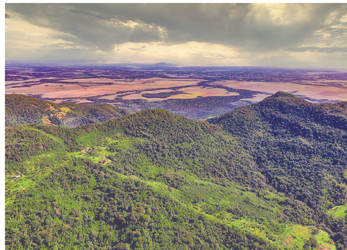
The Ybytyruzu Mountains rise 500 meters above the plains below.