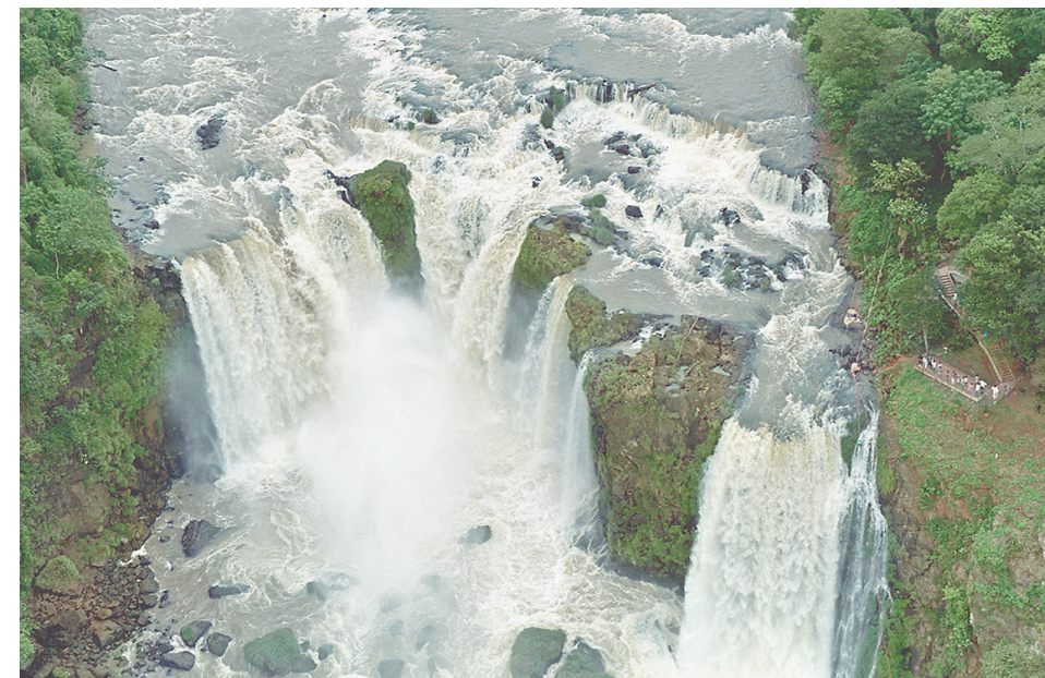
The Salto del Monday Waterfall in Municipal Park Monday drops about 45 meters into the Parana River.

Congratulations to the People of the Republic of Paraguay on the Occasion of the Anniversary of Their Independence