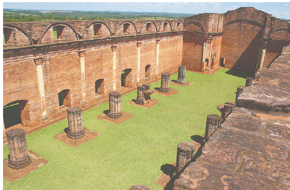
The Ruins of Jesus de Tavarangue were designated a World Heritage Site in 1993. FERNANDO FRANCESCHELLI

This content was compiled in collaboration with the embassy. The views expressed here do not necessarily reflect those of the newspaper.