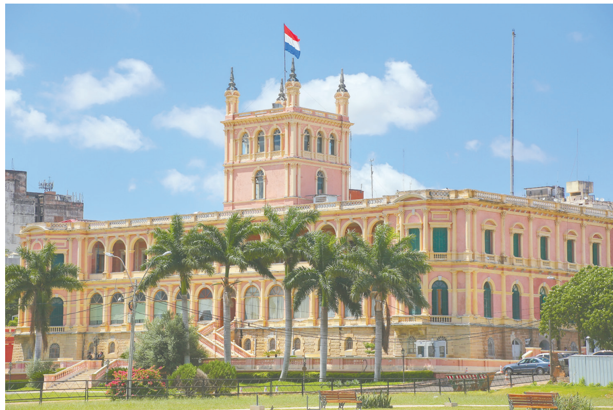
The Palacio de Lopez in Asuncion serves as the seat of Paraguay's government. Bottom right: The National Pantheon of Heroes is a mausoleum for people of significance throughout Paraguay's history.

That spirit of cooperation now extends to the frontiers of science and technology. Engineers from the Paraguayan Space Agency are currently in Japan conducting final environmental tests on the Gua-