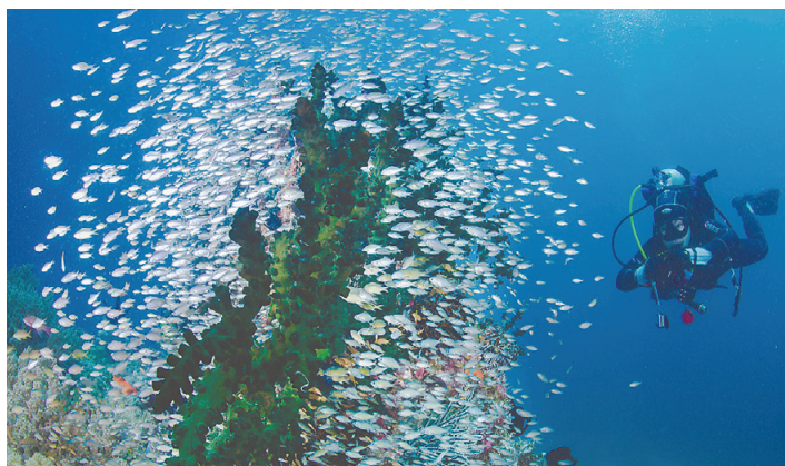
Scuba diving is a popular activity in Romblon province.