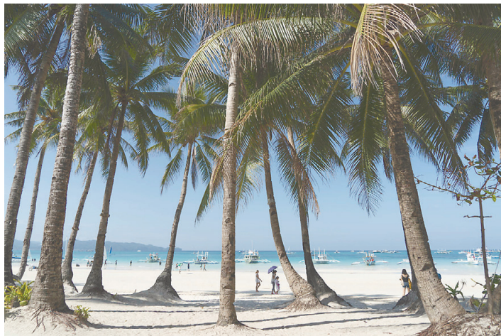
The white sand beaches of Boracay attract sun lovers from all over the world. PHILIPPINES DEPARTMENT OF TOURISM

This content was compiled in collaboration with the embassy and references excerpts from official government websites.