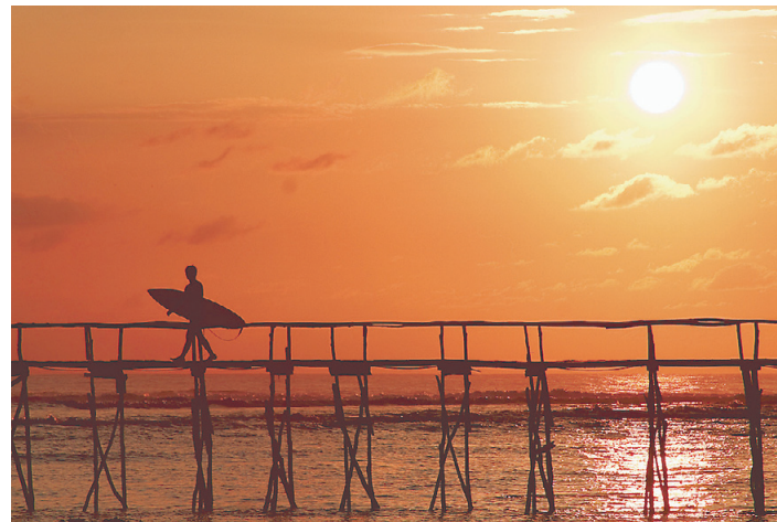
Cloud 9 is a world-class surfing destination on Siargao Island, Surigao del Norte province.