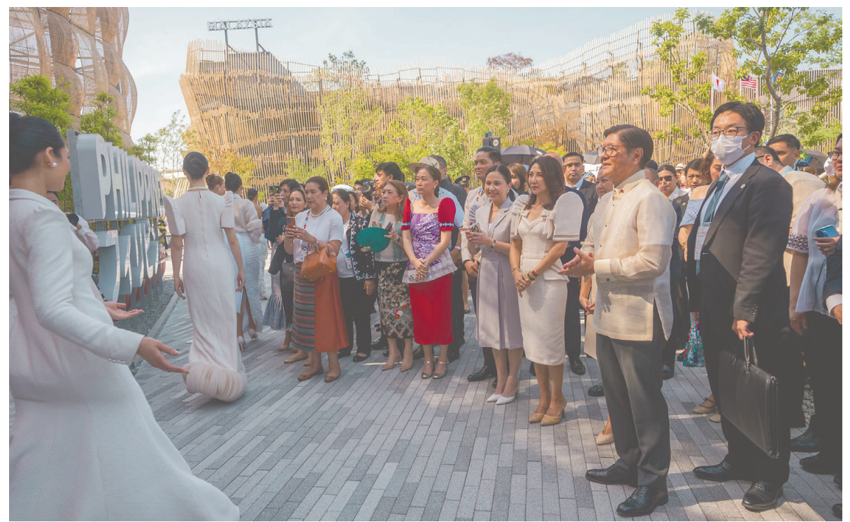
Above: Prime Minister Sanae Takaichi sits down with Marcos at the 47th Association of Southeast Asian Nations summit in Kuala Lumpur. Left: Marcos visits the Philippines Pavilion at the Osaka Expo.

This content was compiled in collaboration with the embassy and references excerpts from official government websites.