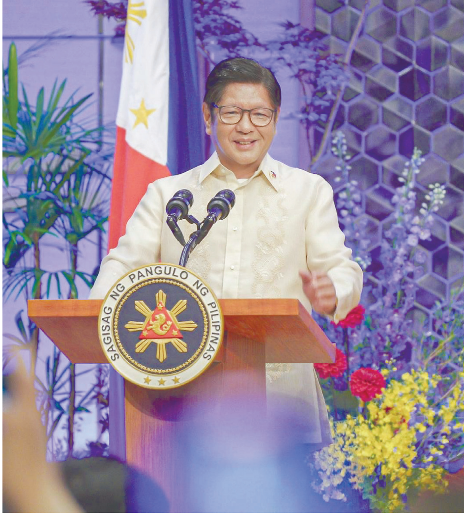
President Ferdinand Romualdez Marcos Jr. EMBASSY OF THE PHILIPPINES

Following his second term as a member of congress, Marcos was elected in 2010 to the Senate. As a senator, he introduced bills on agriculture, education, energy, the environment, housing and tourism, among