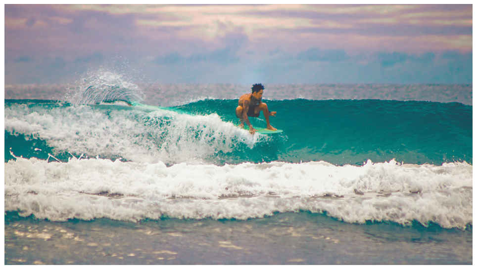
Liwliwa Beach in Zambales province is one of many popular surf destinations in the Philippines.

This content was compiled in collaboration with the embassy. The views expressed here do not necessarily reflect those of the newspaper.