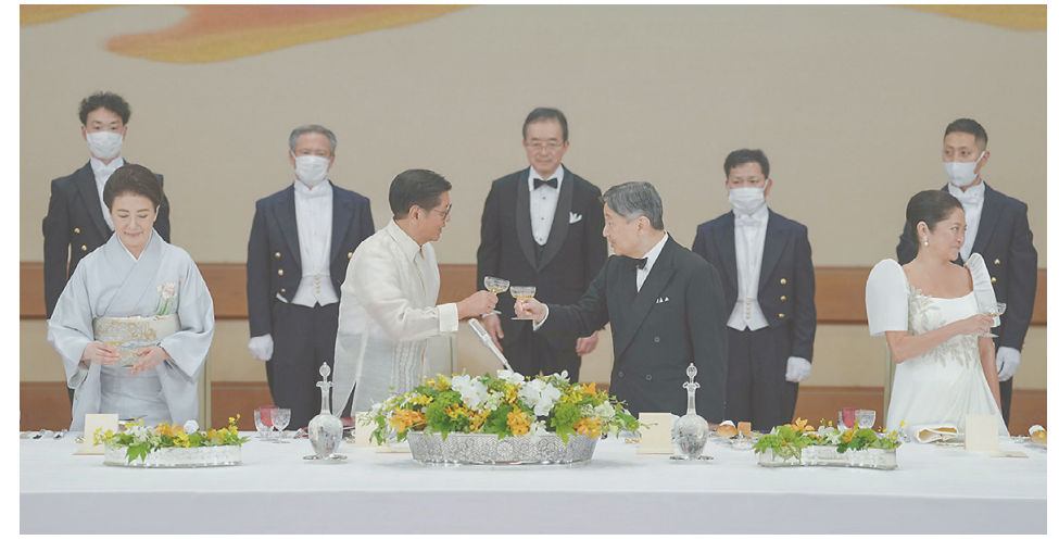
Marcos and the emperor share a toast at the state banquet at Akasaka Palace on May 27.