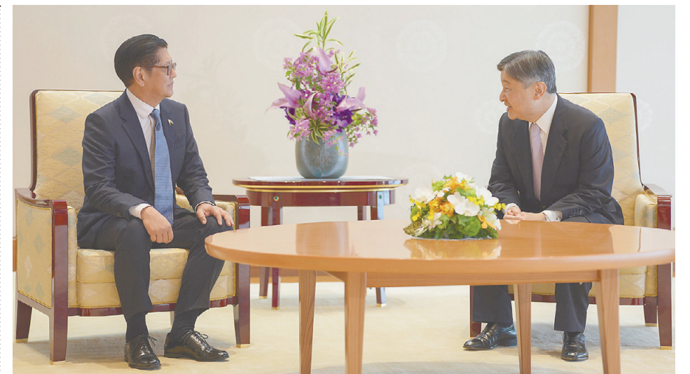
Marcos and the emperor chat during the state visit.

the first of its kind for the Philippines. This milestone reflects how far our relationship has come and the confidence both our countries place in what we can build together in the years ahead.