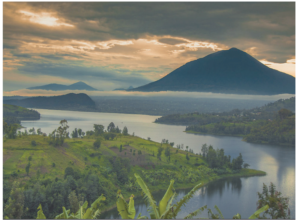
Mount Muhabura rises over Lake Burera and Lake Ruhondo.