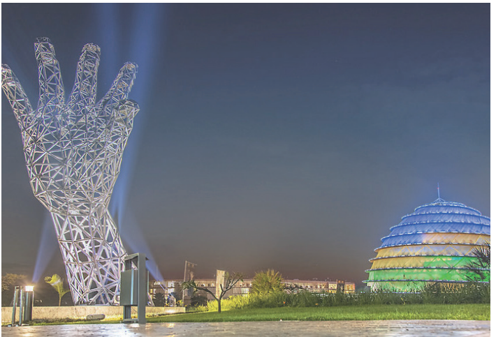
The Kigali Convention Center features a domed auditorium and is home to the 12-meter-high Anti-corruption Monument.

This content was compiled in collaboration with the embassy. The views expressed here do not necessarily reflect those of the newspaper.