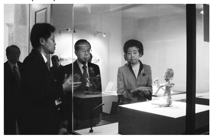
Distinguished guests: Emperor Akihito and Empress Michiko (above) admire some of the artifacts at the Sri Lanka Cultural Heritage Exhibition at the Tokyo National Museum in November. (Below) Former Prime Minister Yasuo Fukuda and his wife (below) visit the exhibition.

The Sri Lanka Cultural Heritage Exhibition, the first mega-exhibition presented to the ople of Japan in the history of Japan-Sri Lanka relations, contributed immensely to further strengthening the longstanding friendship between Sri Lanka and Japan. The exhibition, which was held at the Tokyo National Museum for three months from September 2008, provided a unique window for the Japanese public to see for themselves the rich, 2,500-year-old cultural heritage of Sri Lanka. I take this opportunity to wish the government and people of Sri Lanka peace and prosperity, and promise to work toward sustaining our warm friendly relations.