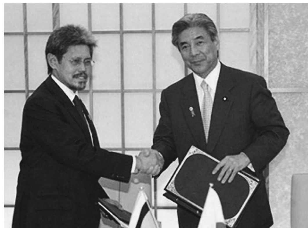
Done deal: Brunei Darussalam's Minister of Foreign Affairs and Trade His Royal Highness Prince Mohamed Bolkiah and Foreign Minister Hirofumi Nakasone sign the Double Taxation Agreement between Brunei Darussalam and Japan at the Ministry of Foreign Affairs in Tokyo on Jan. 20.

Brunei Darussalam and Japan have been actively engaged in capacity-building programs and workshops in wide-ranging areas of cooperation organized in either country at all levels, encompassing government officials, private-