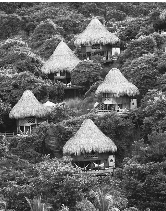
Vacation heaven: Tayrona National Park lies on the Caribbean coast, one of South America's loveliest coastlines.

activities are directed toward strengthening the ties of friendship and cooperation that were established by Japan and Colombia in 1908.