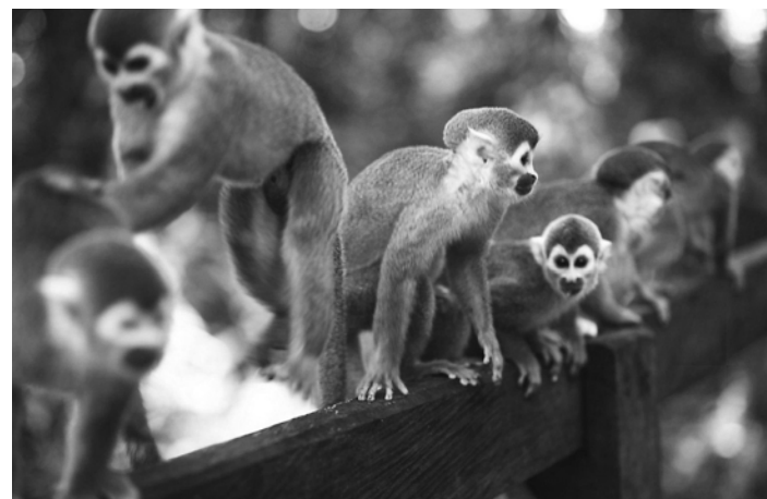
Monkey business: Squirrel monkeys live in the tropical forests of Central and South America in the canopy layer.