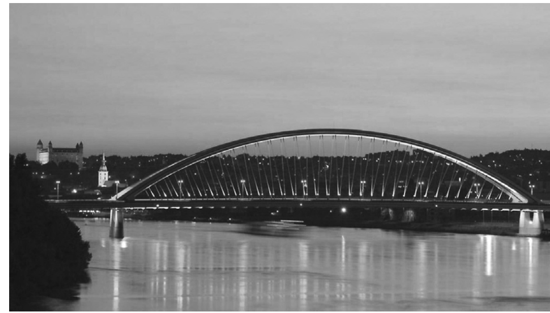
Inspirational landmark: The Danube runs through Slovakia's capital Bratislava.

The favorable and transparent investment environment attracted up to 20 Japanese companies to place their production units in Slovakia. Today, brand names such as Sony and Panasonic are manufacturing here their products for European markets, including Russia. Yazaki Corp. as a major supplier for the automotive industry is maintaining its operations despite the hard times