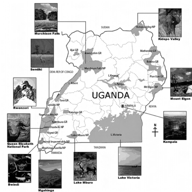
Natural wonders: The national parks of Uganda UGANDA EMBASSY

Due to the strong bilateral relations between Uganda and Japan, as well as the inextricably close cooperation between Japan and Africa, our two countries continue to cooperate closely in the Security Council on issues promoting peace and security, as well as tackling global challenges, in-