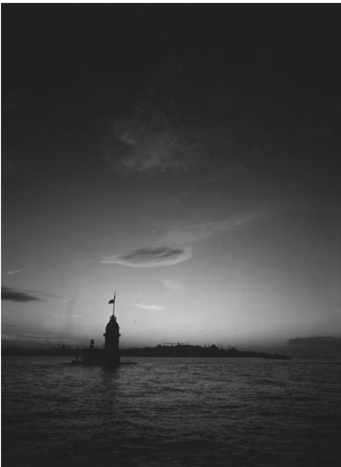
Maiden's Tower: Sitting on a small island in the Bosphorus off Istanbul, "Kiz Kulesi" dates back to 408 B.C. Used for centuries as a lighthouse, the tower is home to a cafe and restaurant with spectacular views of the former Roman, Byzantine and Ottoman capital.

TURKISH EMBASSY OFFICE OF THE CULTURAL AND INFORMATION COUNSELOR