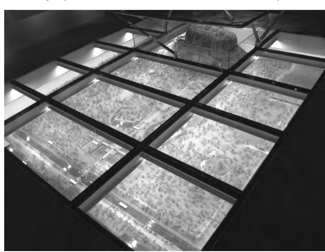
Ancient city: The exhibits at the Sigiriya Museum will give visitors an understanding of the history of Sigiriya from prehistory to the present.

As we are all aware, Japan and Sri Lanka have a very long and rich historical relationship, particularly in terms of cultural exchange involving our shared Buddhist traditions. Thanks to growing commercial relationships, Japa-