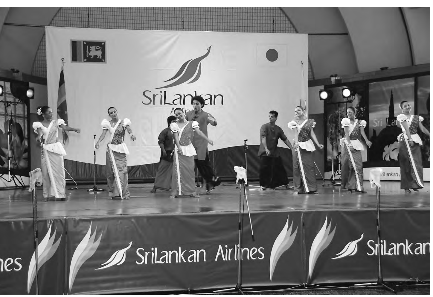
Resplendent land: A Sri Lankan dance troupe performs at the Sri Lanka Festival held Sept. 12-13 at Yoyogi Park in Shibuya Ward, Tokyo.

I look forward with confidence to the enduring friend ship between Sri Lanka and Japan being further enhanced in the coming year and to continuing friendly collaboration and dialogue with the government and peo-