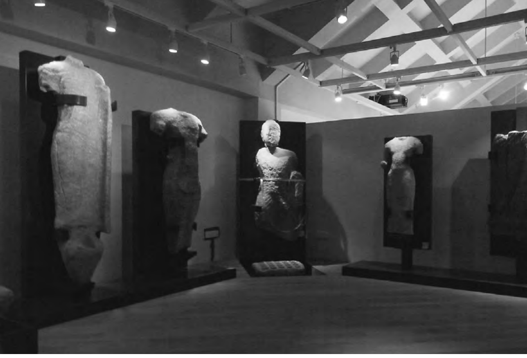
Cultural heritage: The Sigiriya Museum, which opened in July, showcases the results of nearly three decades of archaeological research at the Sigiriya UNESCO World Heritage site and the