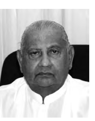
Ratnasiri Wickramanayaka PRIME MINISTER OF SRI LANKA