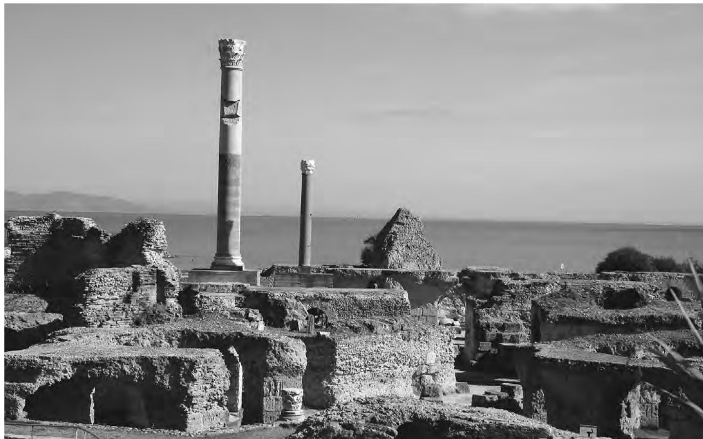
Historical glory: The archaeological site of Carthage on the Gulf of Tunis is a UNESCO World Heritage site.

al relationship has gained its momentum of further progress and has been materializing many programs and projects, such as the South-South Cooperation, the One Village One Product program, the construction of the "Japanese Bridge" in Rades, the annual symposium of Japanese and Tunisian universities, the opening of the North African Bureau of Tsukuba University in Tunis and dialogues among civilizations and religions. I have been also witnessing many interesting and unique programs initiated and developed by numerous groups of peoples in both countries, such as the oldest judo cooperation in the Middle East, the introduction of Japanese abacus teaching in preschool education, the construction of a Japanese garden to-