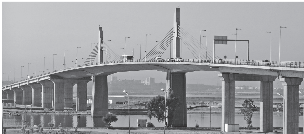
With pride, TAISEI CORP. accomplished La Goulette Bridge, opened on March 21, 2009.