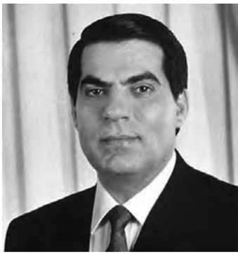
President of Tunisia Zine El Abidine Ben Ali

Although distant in geography, Tunisia and Japan share