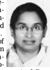
Dr. Dipu Moni FOREIGN MINISTER OF THE PEOPLE'S REPUBLIC OF BANGLADESH

Thirty-nine years ago on this day, the Father of our Nation Bangabandhu Sheikh Mujibur Rahman declared Bangladesh to be an independent and sovereign state.