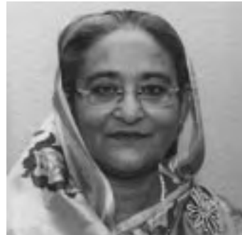
Sheikh Hasina PRIME MINISTER OF THE PEOPLE'S REPUBLIC OF BANGLADESH

I convey my heartfelt greetings to my countrymen as well as to all expatriate Bangladeshis on the occasion of the great Independence and National Day of the People's Republic of Bangladesh.